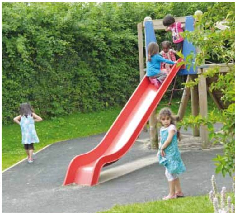
Nature is an important surrounding element of the spaces at Grandpont

purpose, not originally intended for play.