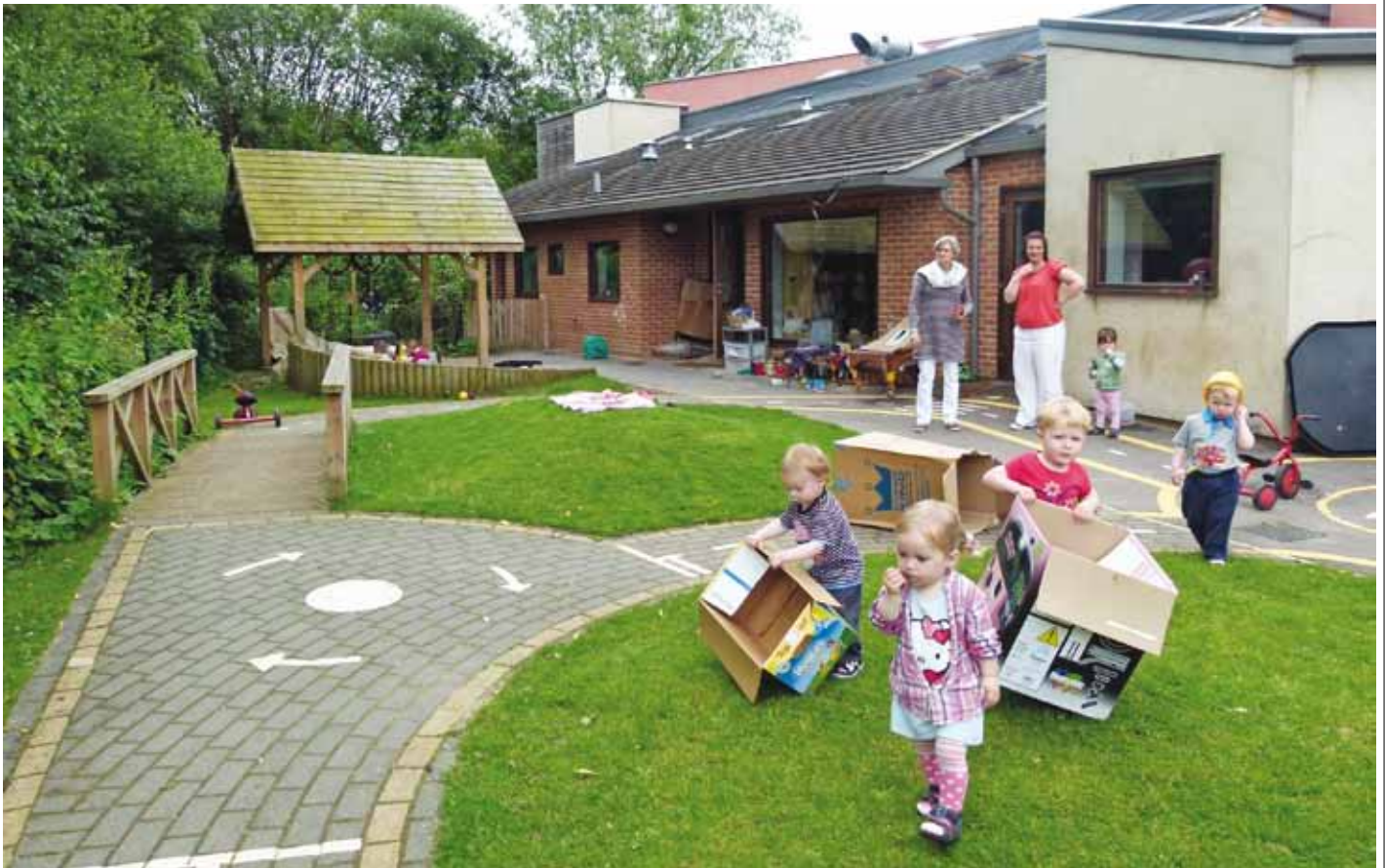
At Grandpont in Oxfordshire, the outdoor space includes winding paths, varied surfaces and both natural and man-made materials